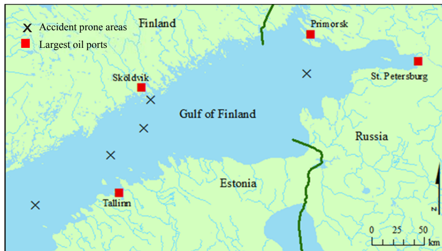
Figure 2.1. Four largest oil ports* of the Gulf of Finland in 2011 (Holma et al. 2011) and areas with large accident risk (Ylitalo et al 2008, Luoma 2010: 37). *Port of Tallinn includes Ports of Muuga, Paljassaare and Paldiski South. (Holma et al. 2011)