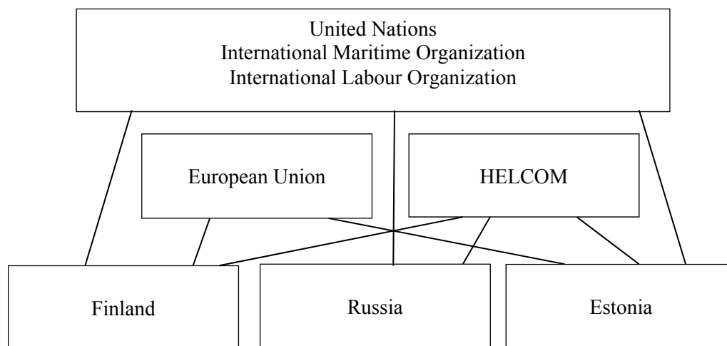
Figure 2.3. Nested hierarchy of the main regulatory bodies of maritime safety in the Gulf of Finland (Kuronen and Tapaninen 2009: 22).

The existing regulatory system is designed to act as a so-called nested hierarchy where the international regulation is the highest level and the lower levels should always be consistent with the higher ones (figure 2.3.) (Kuronen and Tapaninen 2009: 22).